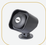
Hooter/Internal Buzzer (optional)

*Software features are provided in different plans, please contact Sales for details.