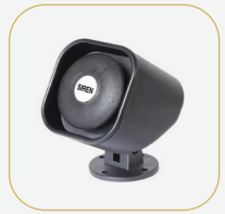
Hooter/Internal Buzzer (optional)