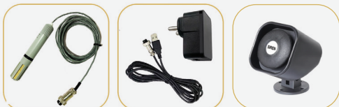
Sensor Probe* Power Adapter Hooter/Internal Buzzer (optional)

*Note: Sensors must be purchased separately. Sensor cable length can be customized; additional charges apply.