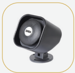
Hooter/Internal Buzzer (optional)

*Software features are provided in different plans, please contact Sales for details.